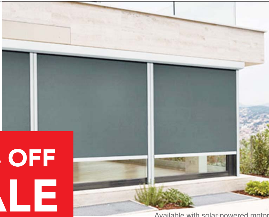
Available with solar powered motor