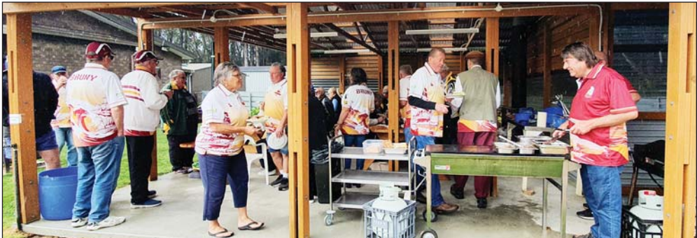
In spite of the inclement weather, four rinks and 32 bowlers completed 12 ends, with Bruny winning in a very tight finish. A BBQ lunch was cooked and enjoyed in the undercover area. (PS)