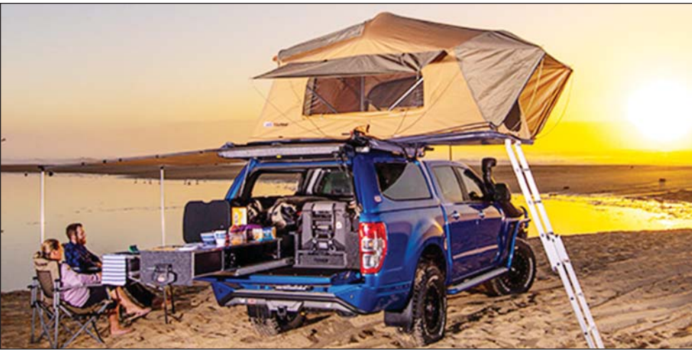
ARB Hobart has all the gear for camping, including rooftop tents. (PS)