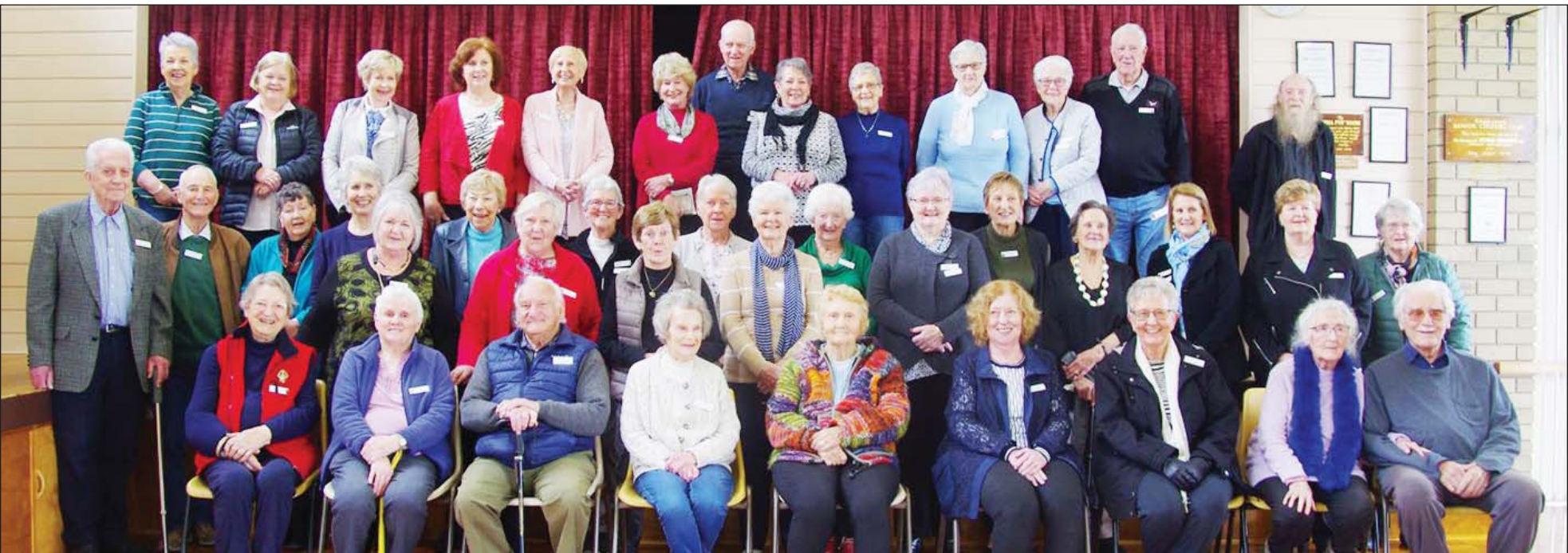
October is Probuc Month, and The Combined Probuc Club of Kingston held a special morning tea to coincide with its regular October meeting.

Huon Aquaculture is planning a coordinated combined industry and community clean up in January 2022.