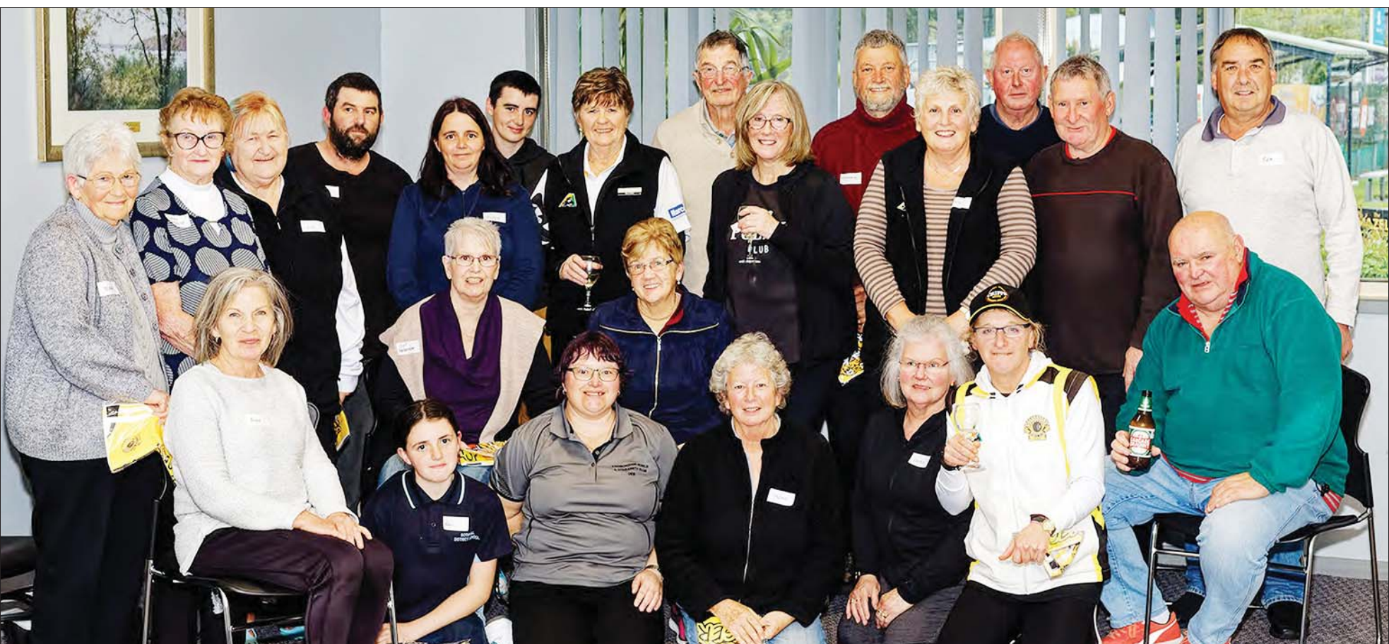
Group of new and returning members at the Kingborough Bowls Clubroom on October 14. (PS)