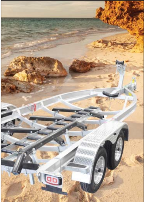
Tasmania's largest range of box trailers and boat trailers can be found at King Towbars and Trailers. (PS)

King Towbars and Trailers has operated as a Tasmanian, family-owned business for over 70 years. With Tasmania's largest range of box trailers and boat trailers, King Towbars and Trailers have trailers in stock to suit most requirements. In addition, they custom build trailers to meet specific needs. King Towbars and Trailers also stock a full range of spare parts for trailers and caravans, with onsite technicians available to provide repair services. View the range at 5-9 Florence Street, Moonah or online at kingtt.com.au