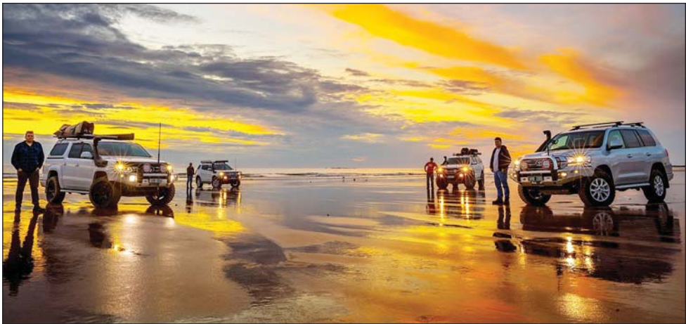
Off-road adventures need quality, durable gear. ARB Hobart's experienced staff can assist with advice on the best gear for all conditions. (PS)