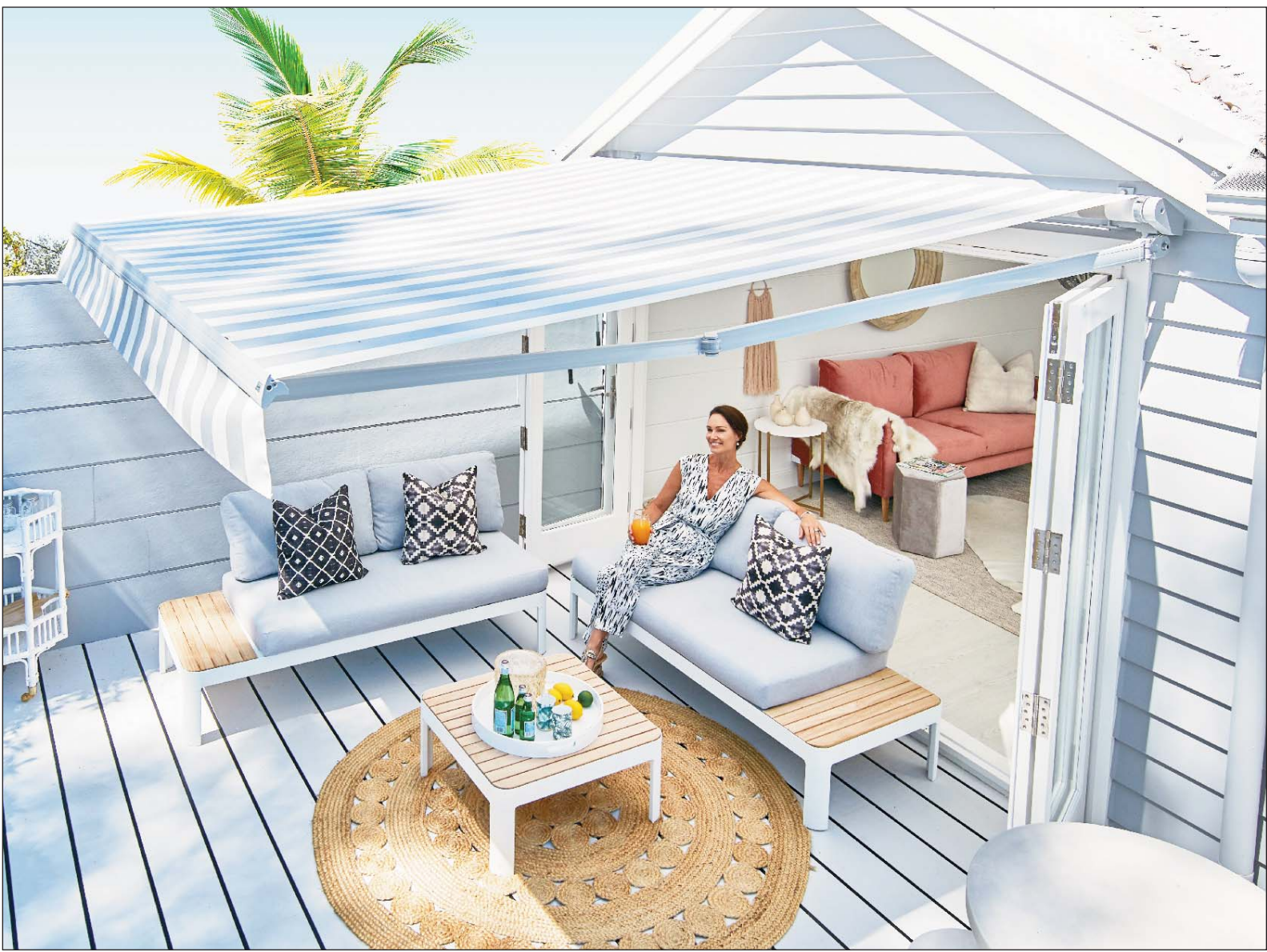
HFT Interiors has summer covered, with a large range of modern and traditional awnings to suit all windows and spaces. View the showroom in Mertonvale Circuit (PS)

Visit the showroom and meet the friendly Luxaflex specialists.