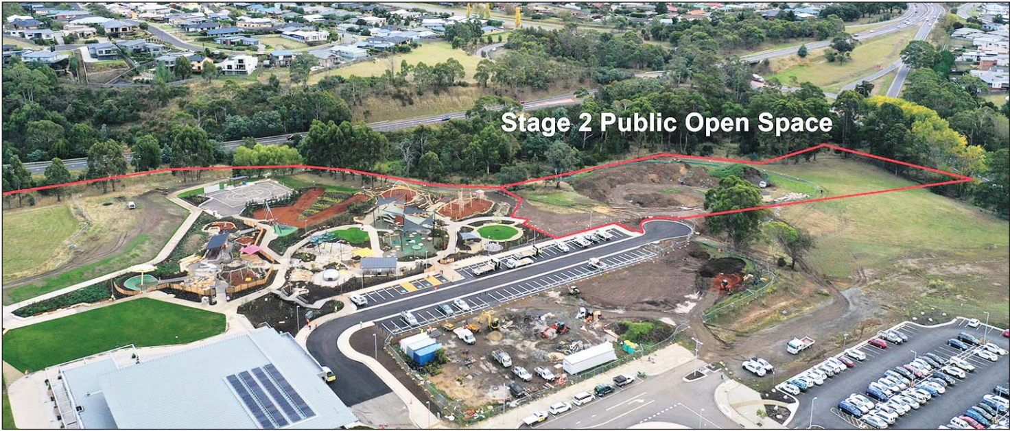
Construction has commenced at Kingston Park for Stage 2 of the public open space. MS Civil Pty Ltd are the contractors for the project, with Stage 2 provid- ing more open areas, dedicated spaces for larger events, bike riding and exercising. Kingborough Council expects Stage 2 to be finalised by mid-2022. (PS)

Kingborough Chronicle is distributed by local contractors into mail boxes every week, commencing on Tuesdays with a total of 4,100 copies. 5,200 copies are delivered to the businesses listed above. PLEASE NOTE: Areas that are not accessible by footpaths will not have mailbox delivery.