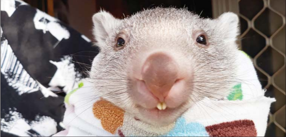
An orphaned wombat cared for by Bonorong. (PS)

If you find an injured animal, please call Bonorong's 24-hour hotline on 0447 264 625.