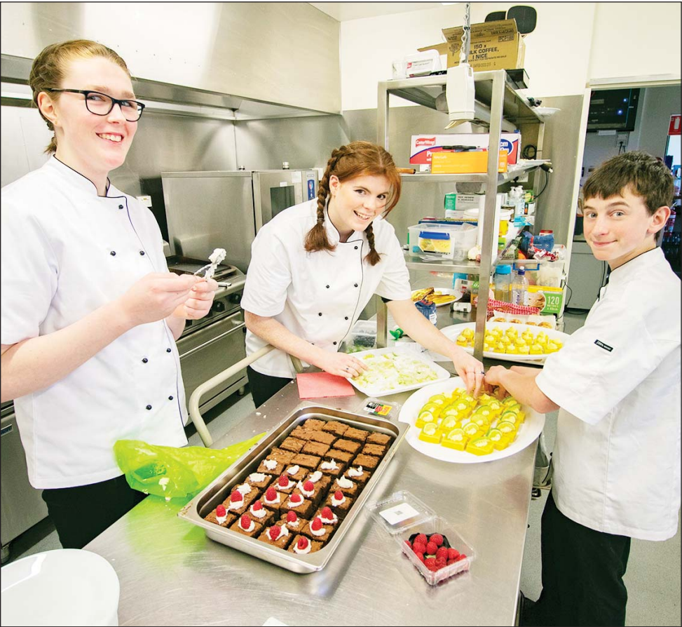
Young hosts volunteered to provide a catered afternoon tea at the Twin Ovals Function Centre in Kingston for community members aged over 65 years.

Kingborough's elderly community members enjoyed a unique social gathering while Kingborough's young people gained hands-on catering experience.