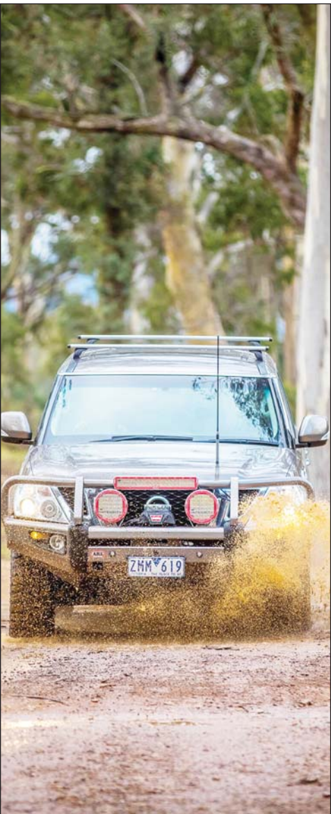
ARB stocks 4WD accessories for off-road adventures. (PS)

Plan an adventure, view the gear at www.arb.com.au and take a trip to 5-9 Florence Street, Moonah.