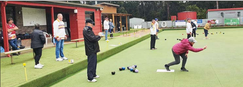
On Sunday, October 3 the Kingborough Bowls team travelled to Adventure Bay for the annual Kingborough and Bruny Bowls Day with the Bruny Bowls Club. (PS)