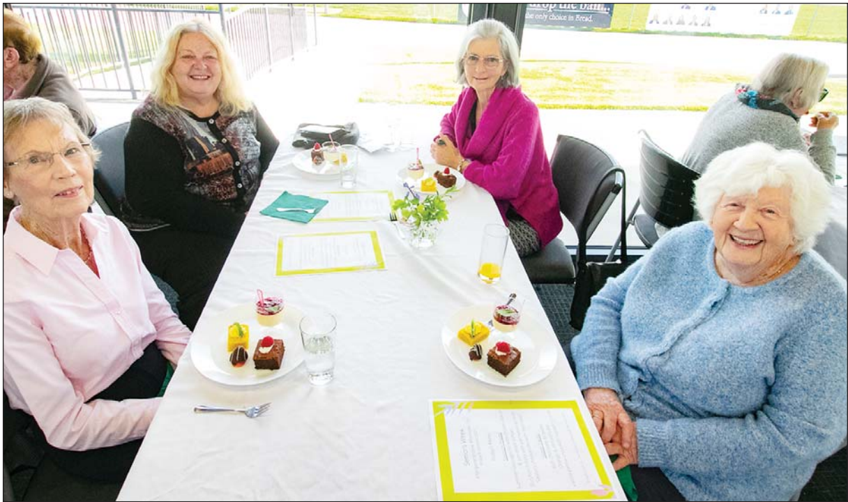
An intergenerational afternoon tea was held in Kingston for community members aged over 65 years, catered for by young volunteers. (PS)