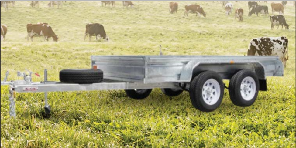
King Towbars and Trailers custom build trailers to meet specific needs. (PS)