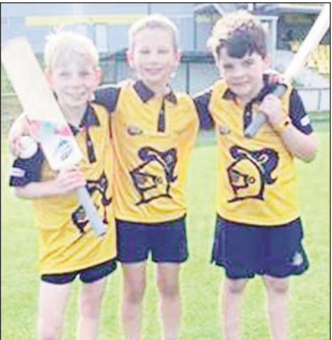
The cricket program at the Kingborough Knights Cricket Club offers opportunities for all ages, and all skill levels. (PS)