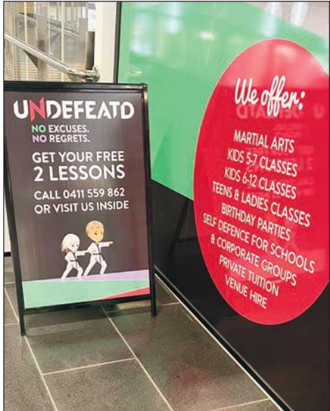
Self-defence lessons guide students in areas such as fitness, motivation, coordination, self-discipline, focus, resilience and respecting oneself and others.