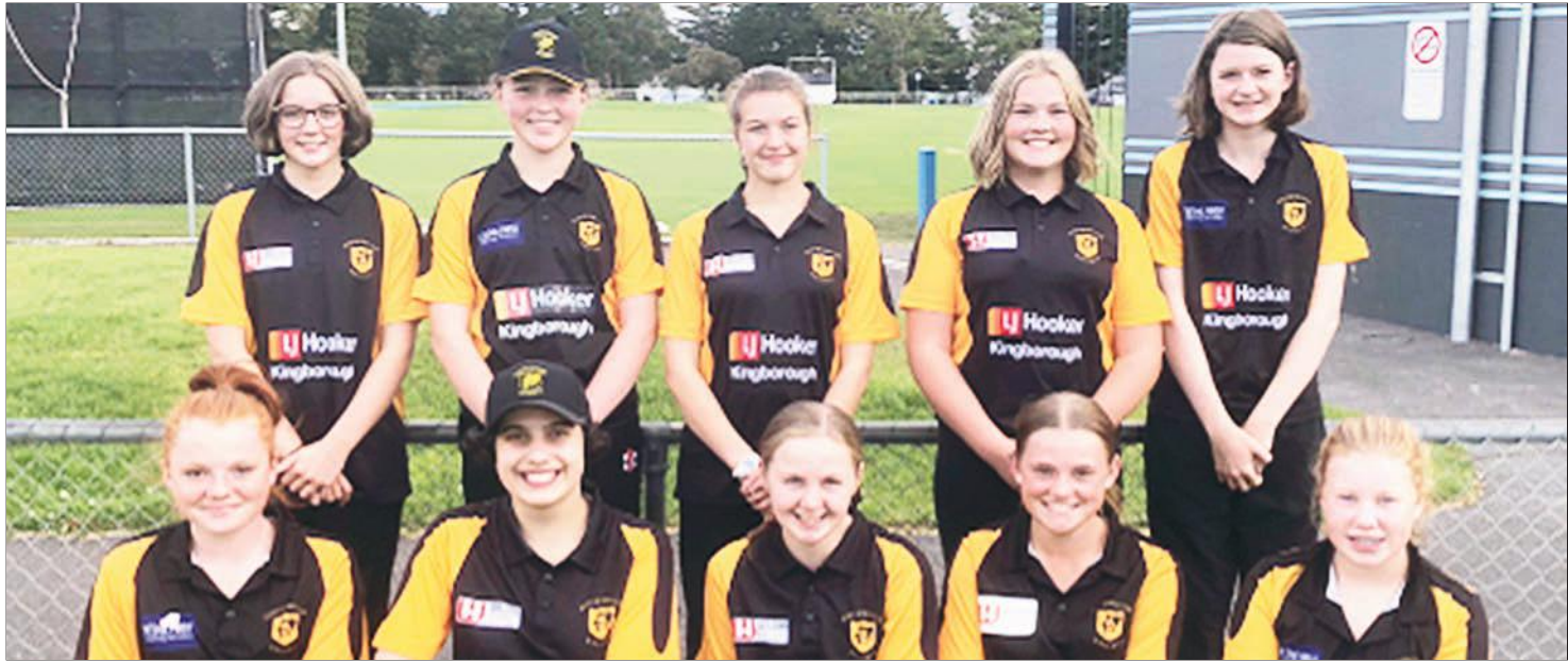
Kingborough Knights Cricket Club is excited to promote a new Stage One Girls competition. (PS)

For enquires, please email juniors@kingboroughknights.com.au