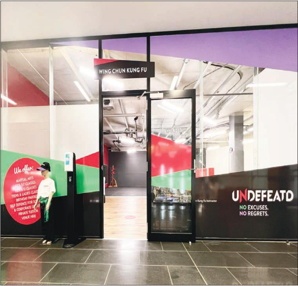
The martial arts school UNDEFEATD has relocated to the mezzanine level of Channel Court Shopping Centre in Kingston. (PS)