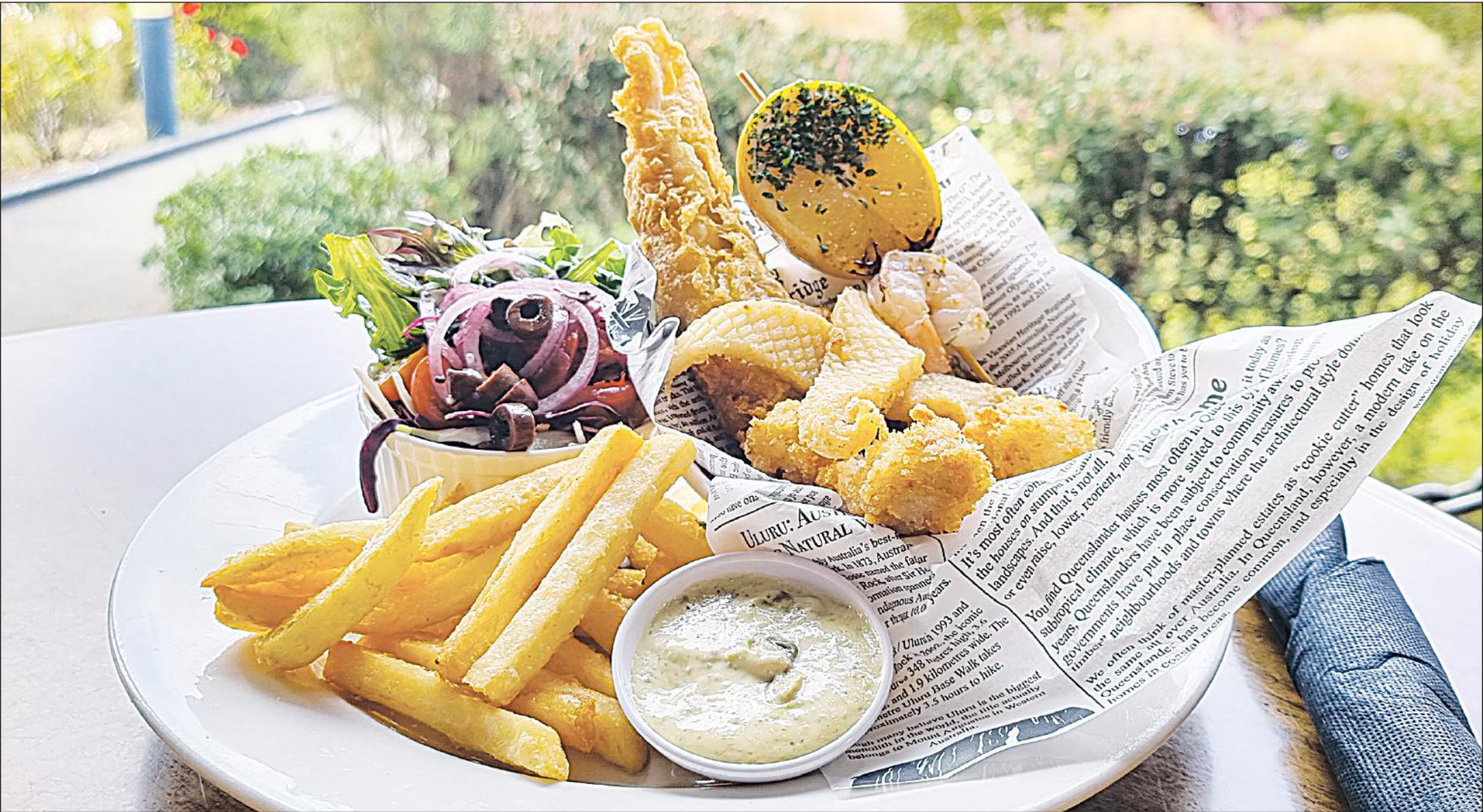
Dine with Dad on the waterfront in the heart of Port Huon, in the comfort of the charming and iconic Kermandie. The restaurant is now taking bookings for Father's Day on 6297 1052. Call today to reserve your table. (PS)