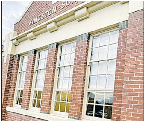
The brick building on Hutchins Street opposite the Kingston Library was constructed in the 1930s. It housed the old Kingston primary school and is in the process of being restored. (PS)

Retirees seeking to learn or be more active can visit and/or join U3A at www.u3akingborough.org.au , visit the old Kingston Primary School, or write to PO Box 479, Kingston, 7051, to find out more.