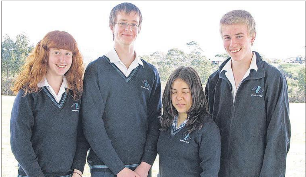
Students in the new uniform, on the new site, 2011. (PS)