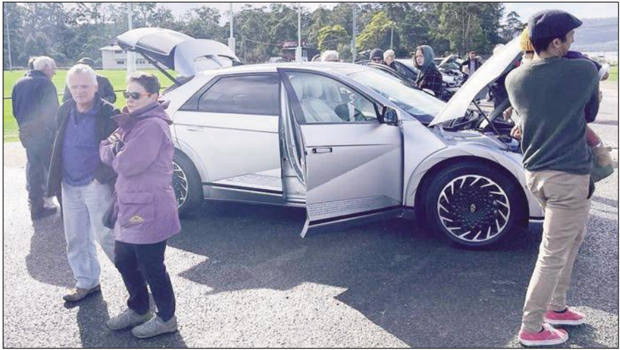
More than 400 people flocked to Snug on Saturday, August 20, for the Snug Electric Vehicle Fair.

“Meanwhile NZC is examining how best to measure the current carbon footprint of the Channel area among homes and businesses which can be monitored for improvements in areas like greater use of EVs, increased rooftop solar and other home improvements.”