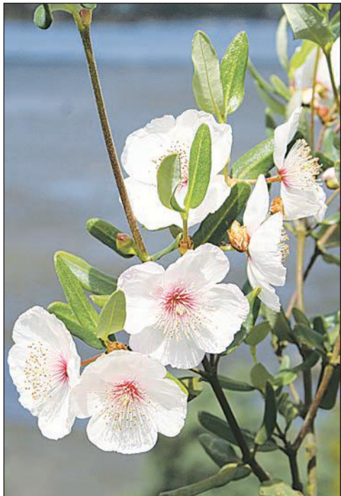
Eucryphia lucida is an understory plant, endemic to Tasmania. (PS)

"Carefully planned, you will have year-round colour."