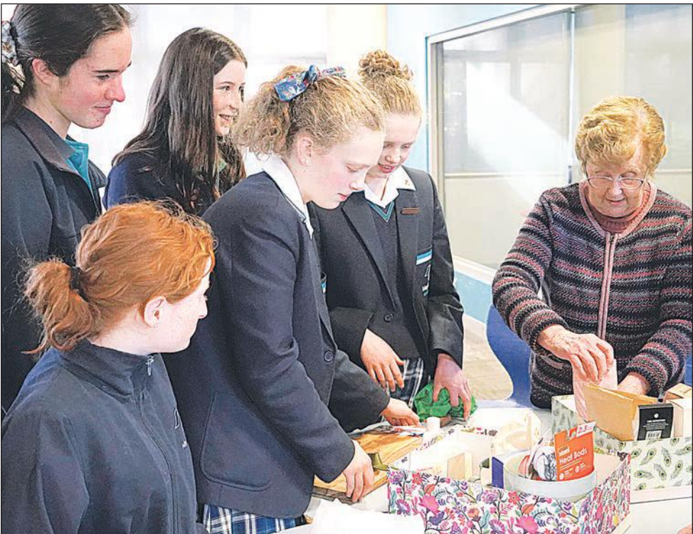
Kingston High Z Club spent a productive lunch time packing hamper boxes to raise money for one of Zonta International's major initiatives. Zonta Birthing Kits enable women in developing countries to give birth in a safer manner. The kits, which cost about $5 each, consist of a sheet of plastic, gauze, string, a blade, soap and gloves. The plastic bag and the plastic sheet are treated with an organic compound that helps the plastic break down. (PS Ray Quinn)