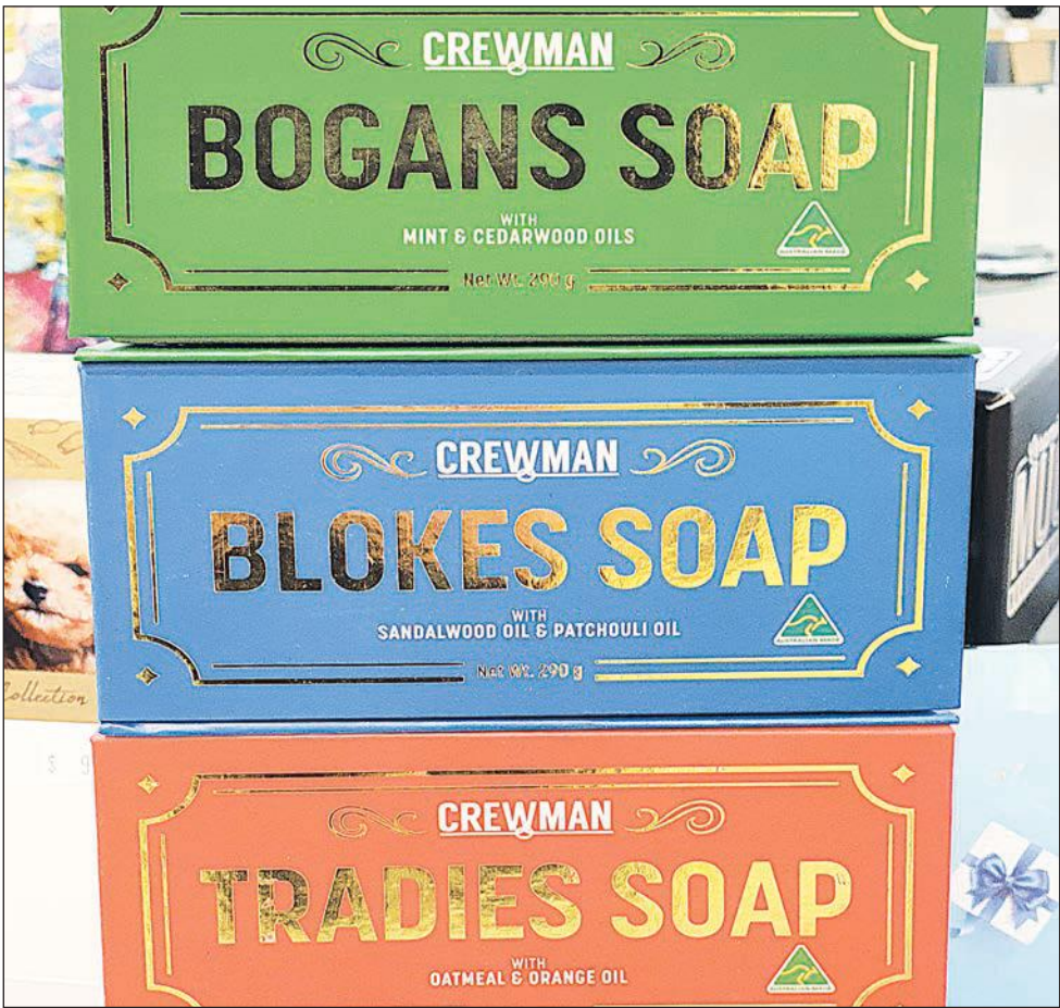
Crewman Soaps are Australian made, for Australian men. Hence, they come in Tradies, Blokes, Dads, and Bogan Soap varieties. Divine scent options include mint and cedarwood, sandalwood and patchouli oils, oatmeal and orange, or patchouli and cedarwood. Grab a year's supply for your loved one this Father's Day at newsXpress Kingston Town. (PS)