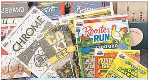
Scratchies are a fun gift idea for Dads who are hard to buy for.