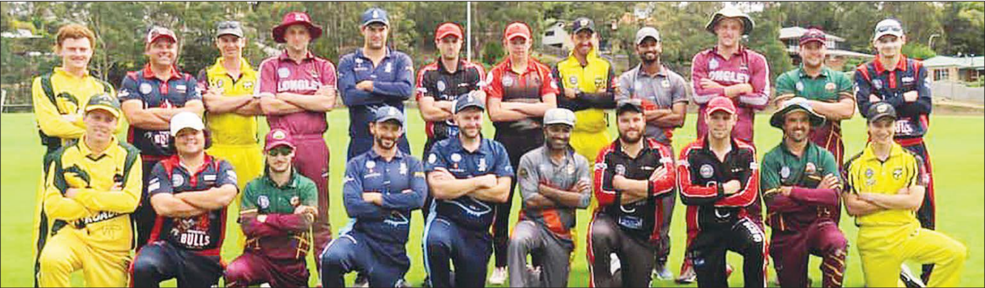
The Huon Channel Cricket Association is holding its annual general meeting on Monday, August 29 at 7pm. All are welcome to come along to the Snug Oval clubrooms at Beach Road, Snug.