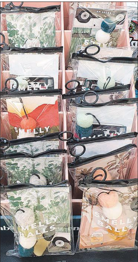
Does your dad have smelly golf balls, hanging on a rope? Smelly Balls are the new “must have” item, for Dads who have everything else. The cheeky, reusable air fresheners are hit at newsXpress Kingston Town. (PS)