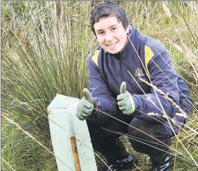
Native tree saplings and bushes were planted in the Peter Murrell Reserve by St Aloysius Catholic College students on Friday, August 5. (PS)

St Aloysius Catholic College is proud to support the National Plant a Tree Day initiative and looks forward to volunteering again next year!