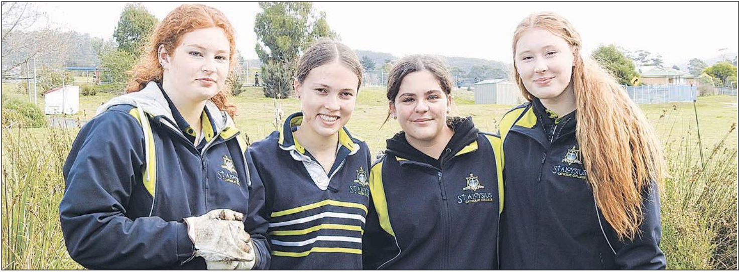
Students added to previous plantings, across the road from the St Aloysius Catholic College campus in Huntingfield. (PS)