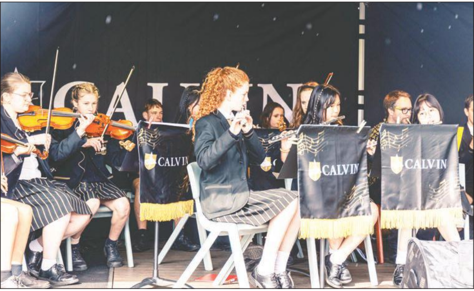
The Calvin Concert Band played for the assembled crowd. A thank you to the Community Engagement Committee and the many volunteers who rallied together to make the Oliebollen Festival a great success.