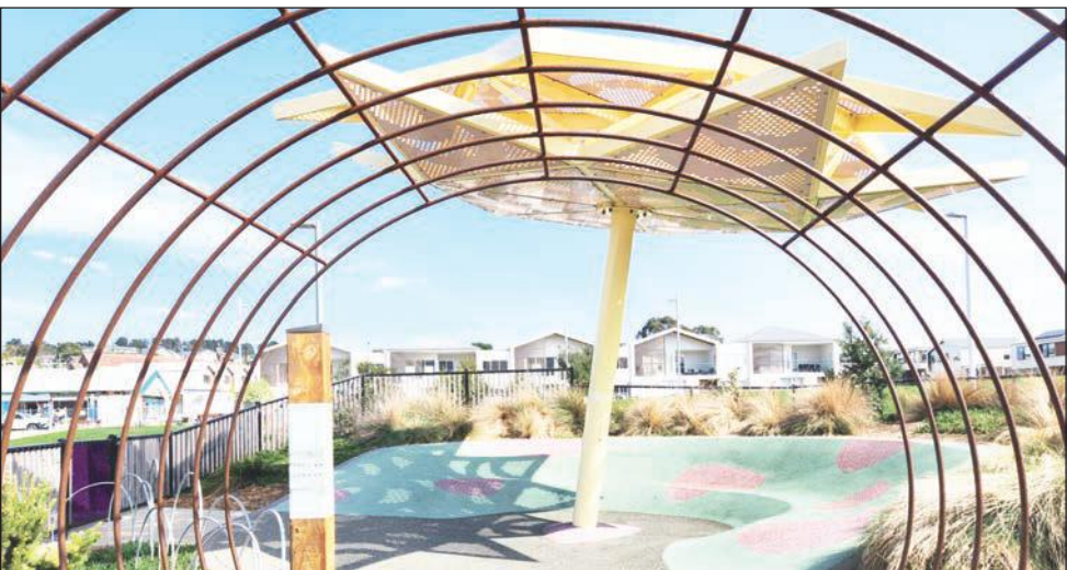
Explore Kingston Park with the family these school holidays. The baby play area with the decorative shade structure provides a relaxing area. It was inspired by a rock daisy and casts intriguing shadows over the space.