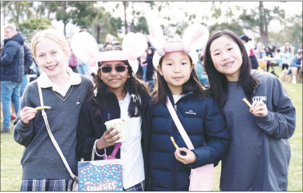
The Oliebollen Festival is the name given to the annual Calvin Christian School Fair, which was held on Saturday, September 9. The festival takes its name from the Dutch word ‘oliebol’ which is a fruit doughnut without a hole.