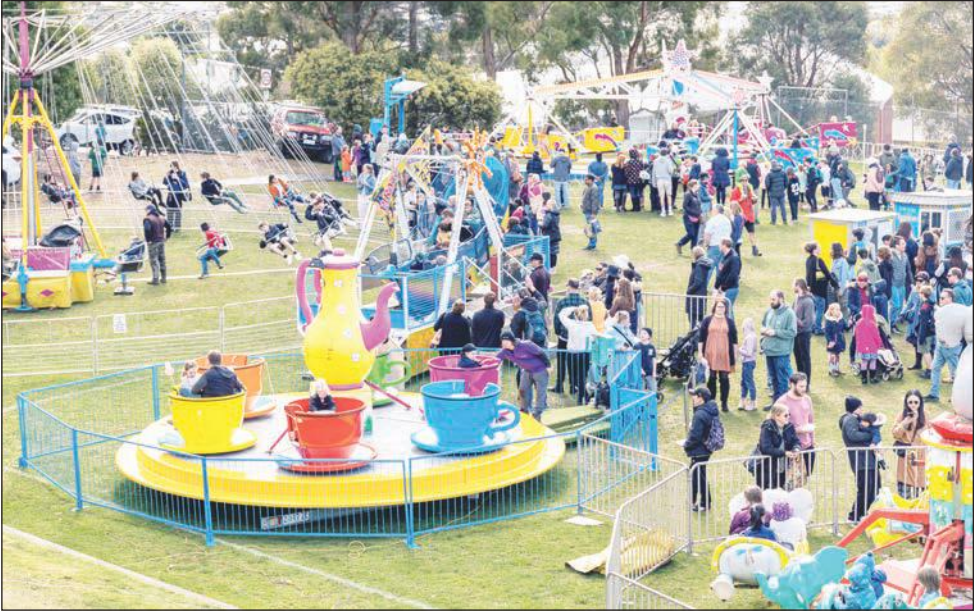
The Oliebollen Festival is more than a school fair. It is a wonderful celebration of the Calvin and Kingston communities. (PS)