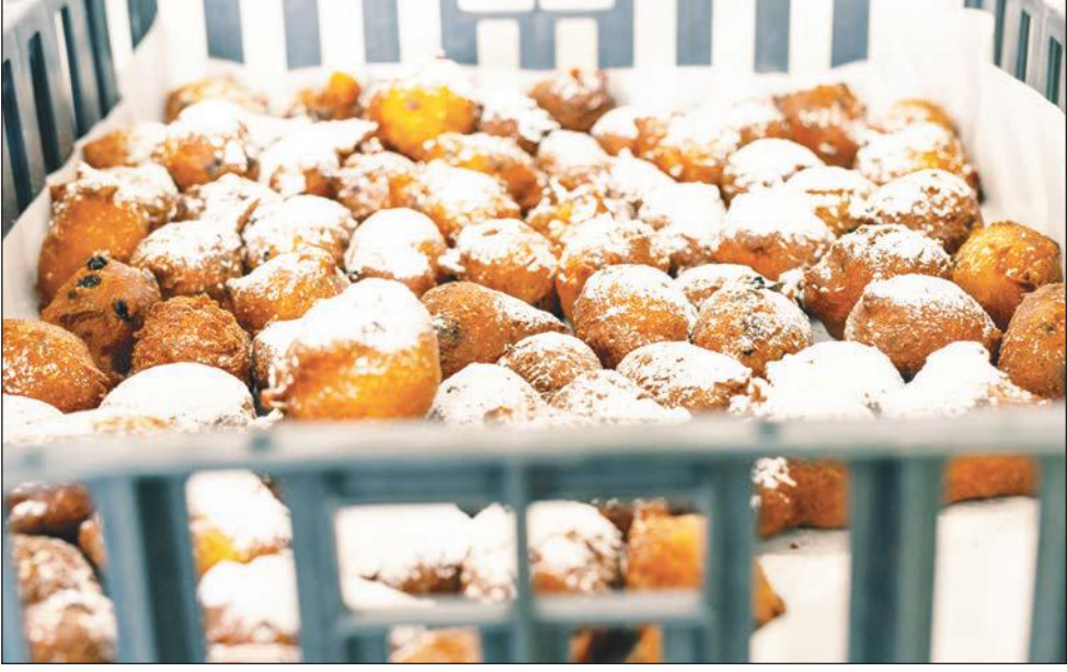
The festival is held on the secondary campus, with people coming from all over Hobart to visit. At the Oliebollen Festival you can buy everything from fresh flowers to second hand goods, but most of all, people come to purchase the traditional ‘oliebol’. (PS)