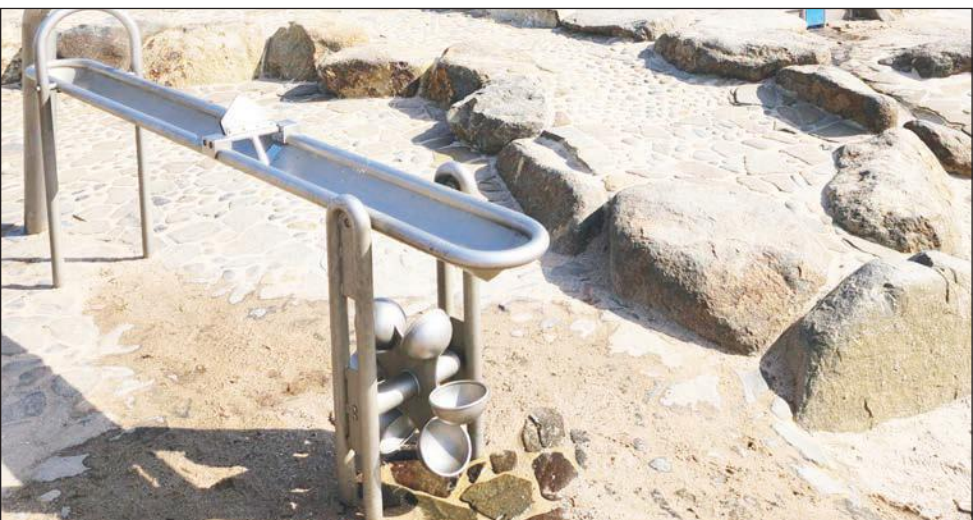
The water play and sand play areas are very popular with kids at Kingston Park, as they spark creative and interactive play.