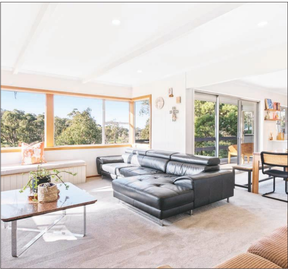
Fall Real Estate