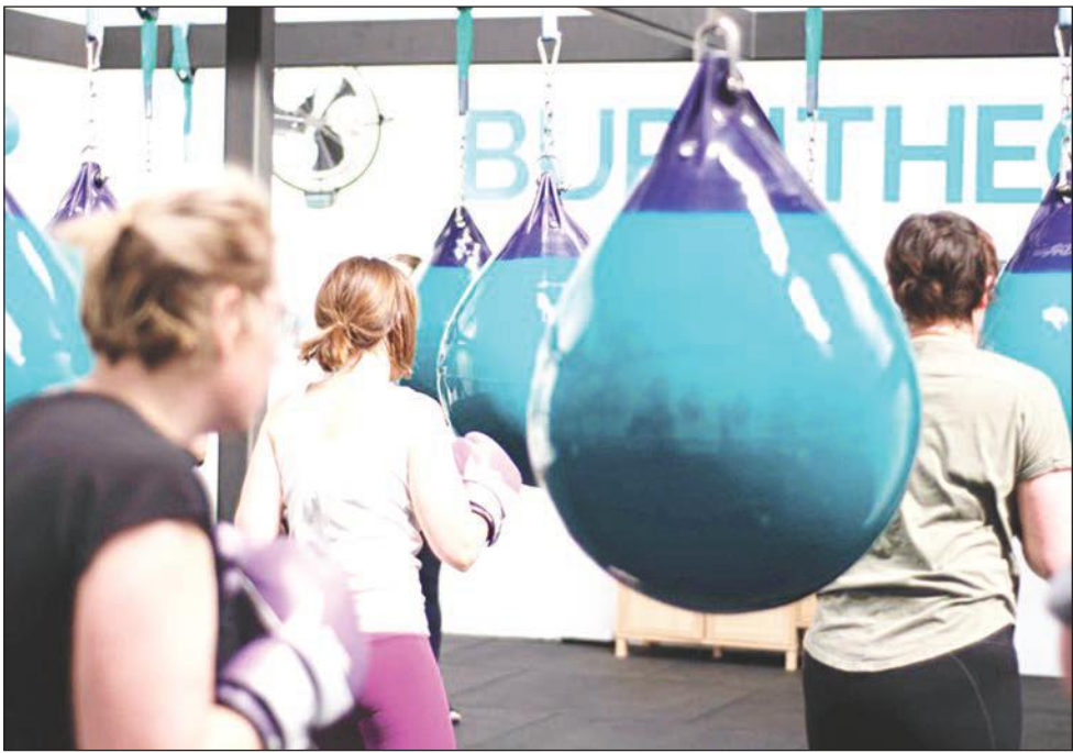
BurnTheory celebrated its grand opening on Saturday, September 9, hosting free 30-minute taster classes across the morning, and finishing with a big members' party that evening. (PS)