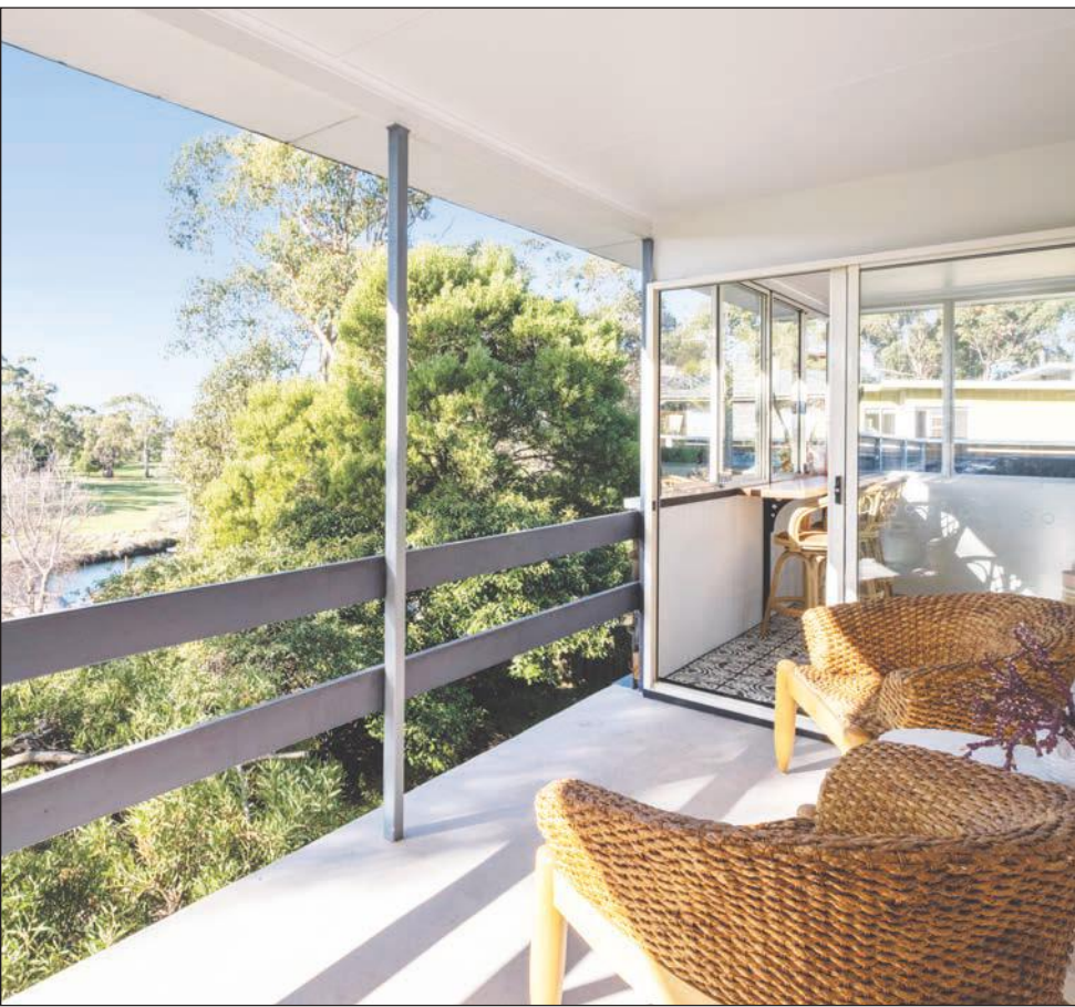
KINGSTON BEACH 2 Roslyn Avenue