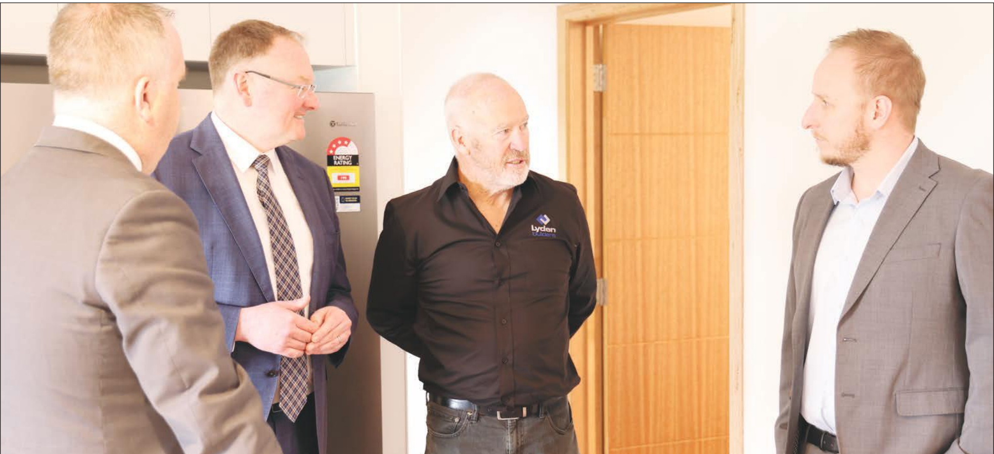
Minister for Housing and Construction Nic Street and Minister for Education, Children and Youth Roger Jaensch officially launched the Under 16 Lighthouse Project on Tuesday, September 12. The service will be delivered south of Hobart and is expected to accommodate up to five young people at once. (PS)

For referrals to the service, contact the Strong Families Safe Kids Advice and Referral Line: 1800 000 123.