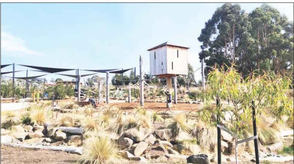
Kingston Park's rope forest includes a tail for balancing and gripping and a forest of poles set amidst a forest of trees, strung with ropes and obstacles to challenge and elevate above the ground.