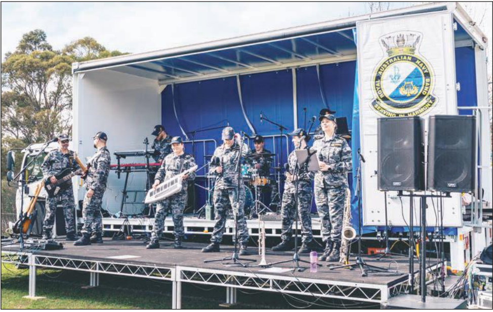
The Oliebollen Festival is a major fundraising event for the school each year and a testimony to the power of community and parent partnership. Tasmania’s Royal Australian Navy Band supported the school with a performance. (PS)