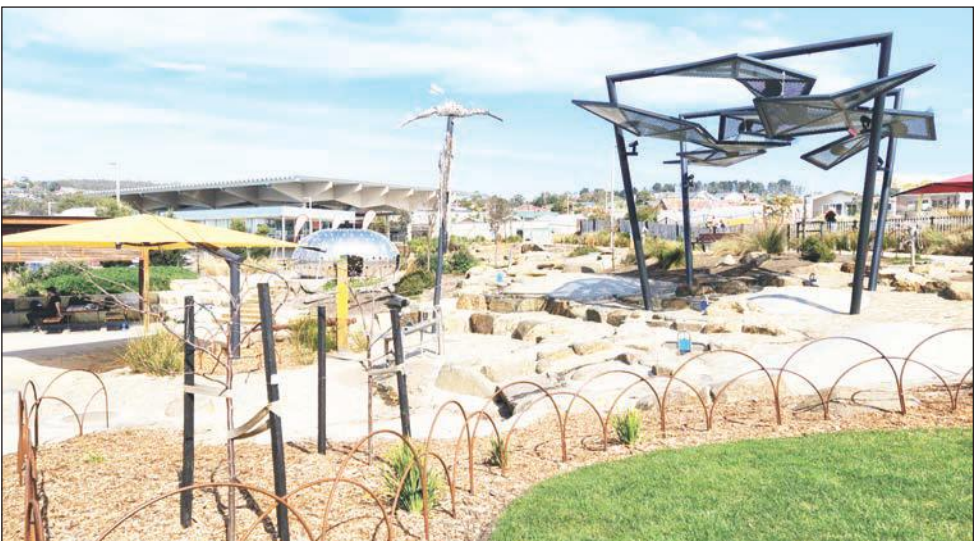
Kingston Park provides play opportunities for all ages and abilities and consists of zones specifically designed for babies, toddlers, primary-aged children, and teenagers.