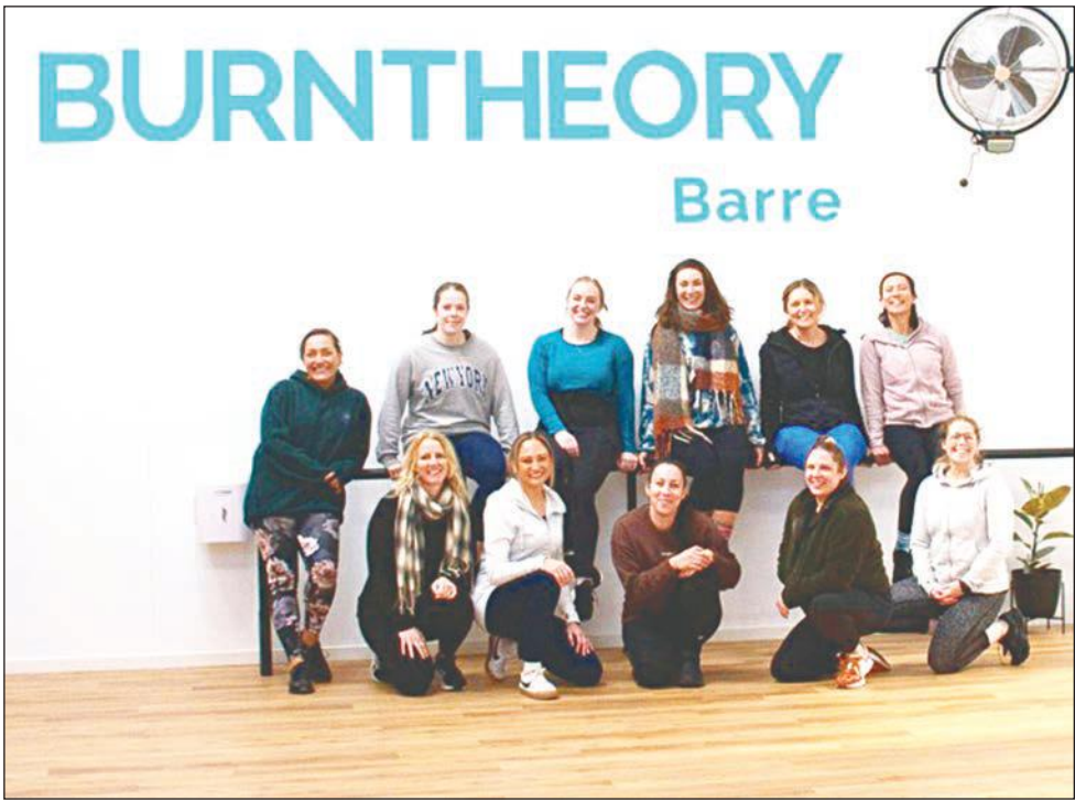
Over 80 women attended the taster classes, getting goodie bags, fueling up at the nourish bar and getting a sense of what BurnTheory is all about. (PS)