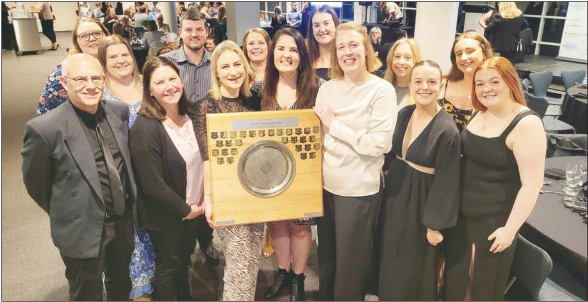
The Kingston Blues Netball Club was awarded the Elise Archer Club Championship for the best performing club at a recent awards dinner. 15 of the club's teams qualified for Grand Finals, with eight of those teams lucky enough to come away with a Premiership.