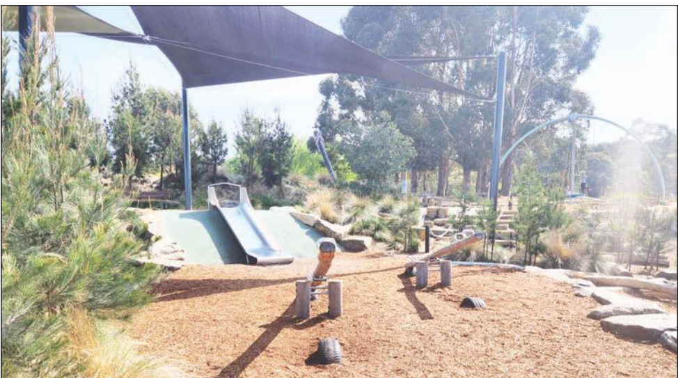
Nestled amongst a forest of she-oaks a little army of she-oak skins scatter and run in the form of seesaws, slides, and log balancing beams.