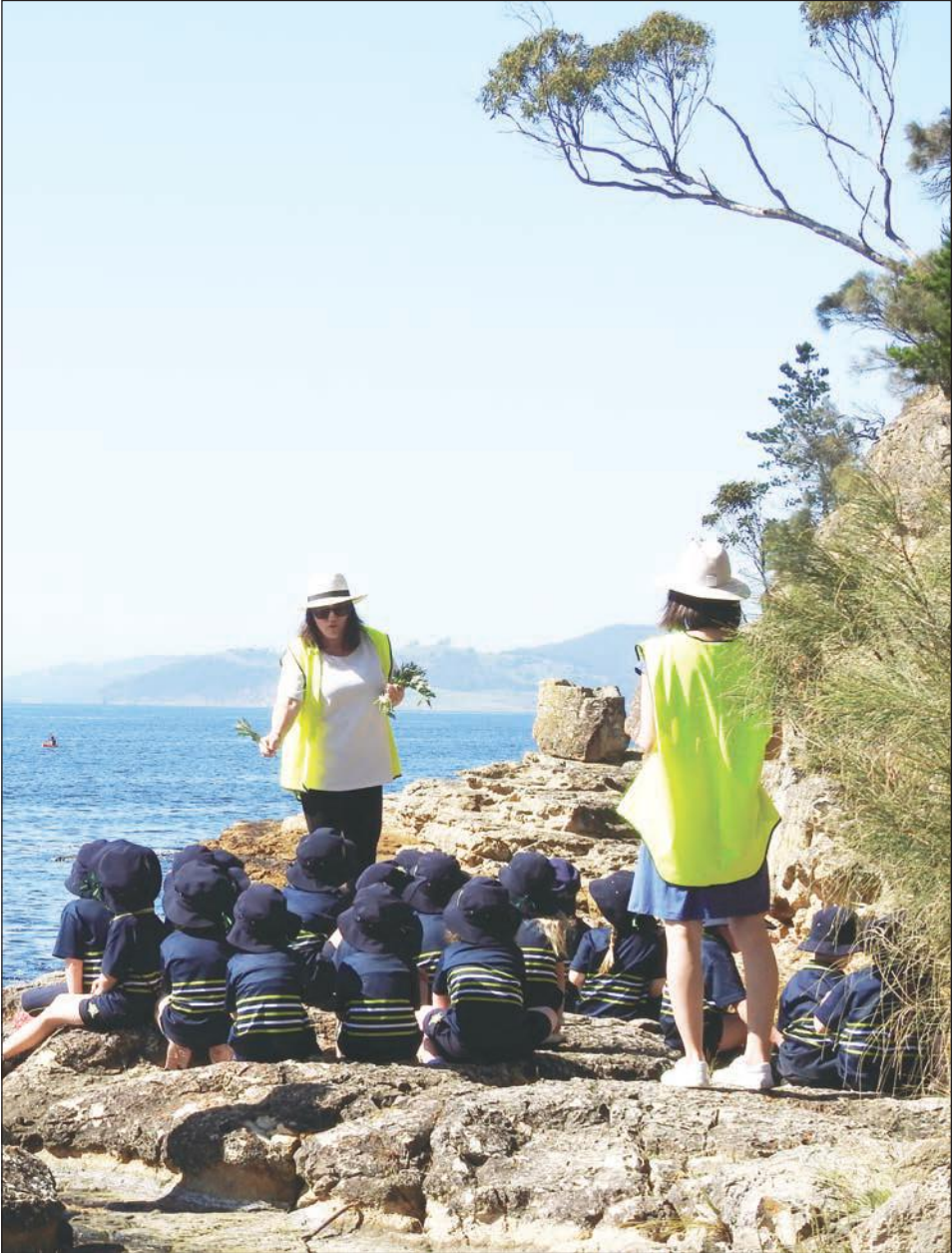
Just a short walk from Boronia Beach, St Aloysius students and staff find serenity amongst their beautiful surroundings.