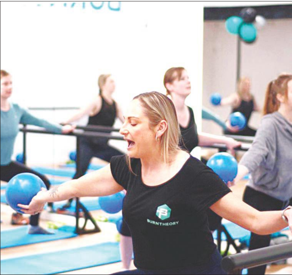
BurnTheory is a fitness studio specifically for women, which provides three effective fitness methods: boxing, barre and release/core, with each giving a results-driven workout. (PS)

"I've wanted to open a studio in the Kingston area for a number of years now, and it's wonderful to finally have the opportunity to grow our studios and provide a well-needed female-focused fitness and wellbeing space in the area."