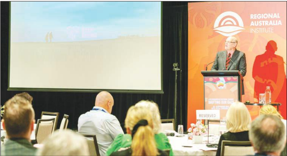
Rural and remote communities including the Kingborough Local Government Area (LGA) are eligible to apply for grants under the recently launched Elders Community Giving Project. (PS)

Across - 6, Banana skin. 8, Over. 9, Call. 10, Sewer. 11, (th)E-ven(etian). 12, Nevermore. 16, Well-oiled. 20, Plum. 22, .A.R.-row. 23, Drip. 24, Poor. 25, Cold reason. Down - 1, Man-age. 2, T-all-ies. 3, Hansom (handsome). 4, Skewer. 5, Snore (anag.). 7, He-Le-n. 13, 'Owl. 14, Misdeal. 15, Sloop (rev.). 17, Enrols (anag.). 18, Lowers. 19, Edis-on (rev.). 21, March.