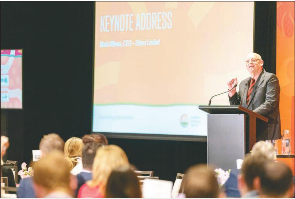
Grants of up to $20,000 will be available for grassroots initiatives that will promote sustainable, focused and long-term change in communities. (PS)