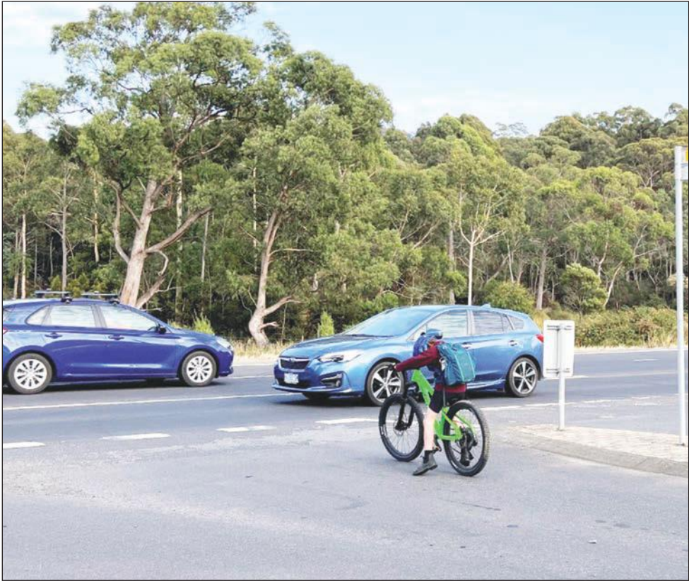
The Greater Snug Safe Paths Project has launched and is asking anyone who witnesses a near miss in the greater Snug area to report it at https://thegreatersnugsafepathsproject.com (PS)