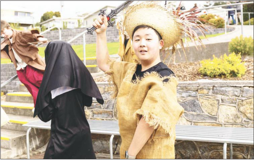
A Calvin student who performed in the production The Fall of Robin Hood wandered around promoting their production and entertaining the attendees. (PS)